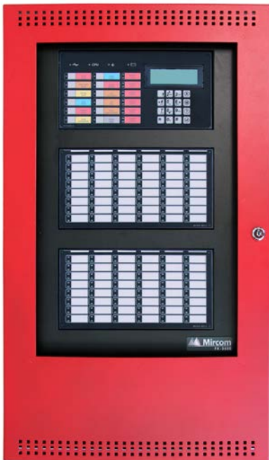
FX-3500 with two optional RAX-1048TZDS modules